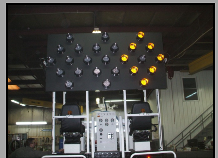
WANCO Arrow Board 48\"/>

2007 GMC T7500 Chassis, serviced with DOT certification, and under 107,000 miles. Equipped with two Titan/SpeedFlo 8.6 GPM Airless Paint Pumps, two 1-1/2\"/>