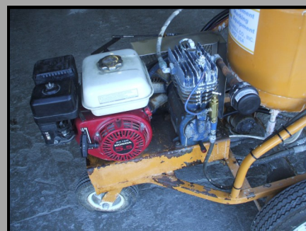
Honda 5.5 HP Engine and Quincy Air Compressor