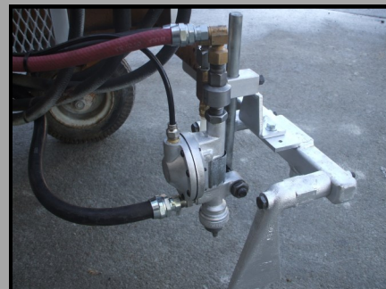
Rebuilt KC-593NBSS-F Paint Guns