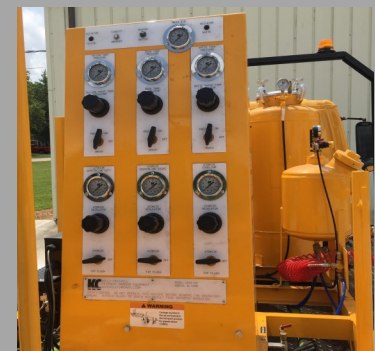
NEW Rear Mounted Operator Control Panel