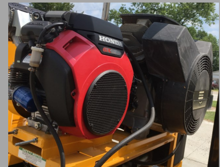
NEW 20 HP Honda Engine Refurbished Atlas Copco Comp.

Refurbished 2000-AS palletized striping unit with Rack and Pinion Steering, 2 - 25 gallon SS Paint Tanks and a 300# CS Bead Tank.