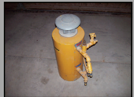
65,000 BTU propane fired boiler

Used Paint Heating System, two each 6" X 36" Basco four pass heat exchangers, stainless steel tubes with cast iron bonnets, 65,000 BTU propane fired boiler, expansion tank, mounting brackets for heat exchangers.