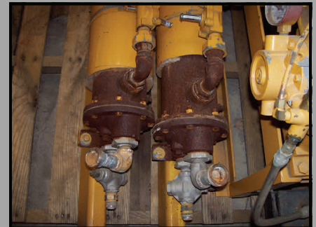
Stainless Steel tubes with cast iron bonnets