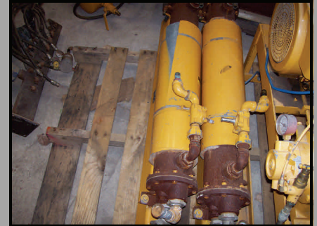
Two each 6" X 36" Basco four pass heat exchangers