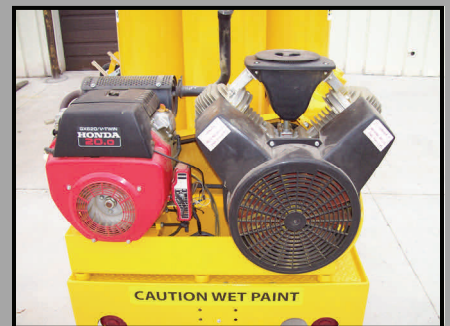
Honda 20HP engine Atlas Copco LE 55 compressor

WV-50-AS-SS, two 25 gallon stainless steel ASME paint tanks, 300# pressure bead tank, 2 gallon cleaner tank, two KC-593NBSS-F paint guns, KC-598 bead guns, Mark 40D skipline control.