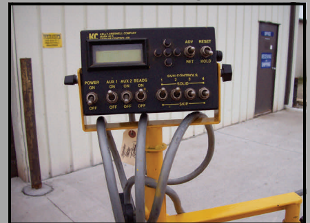
Mark 40D Skipline controller with digital footage counters