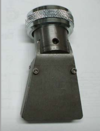
Optional adjustable deflector