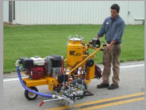
Portable installation KC-593B