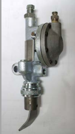
Optional atomize port