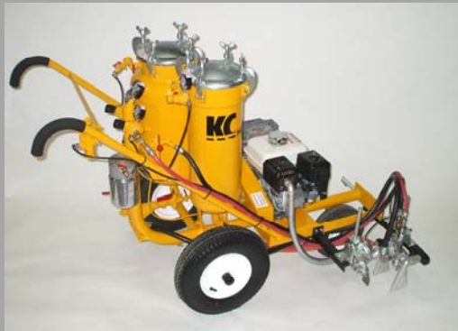
Portable installation KC-593B